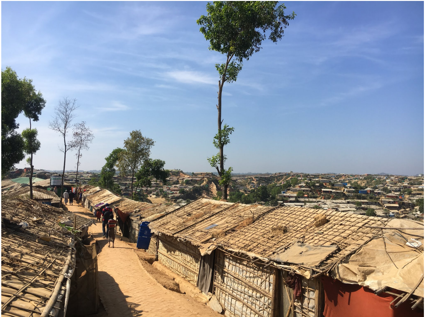
Hakimpara refugee camp in Bangladesh.

The world now has over 70 million forcibly displaced people. This is the highest absolute number in history, and the proportion of displaced people has risen by a dramatic 48 percent in recent years—from about 1 in every 160 people in 2009 to 1 in every 108 people today,