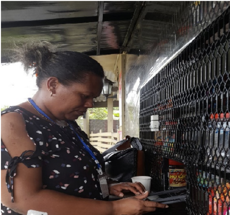
STR baseline interview--Team West ©2023

In collaboration with the Fiji Bureau of Statistics, the Reserve Bank of Fiji, and the Asian Development Bank, researchers are conducting a randomized evaluation to measure the impact of a reform enabling businesses to use moveable property as collateral for accessing credit.