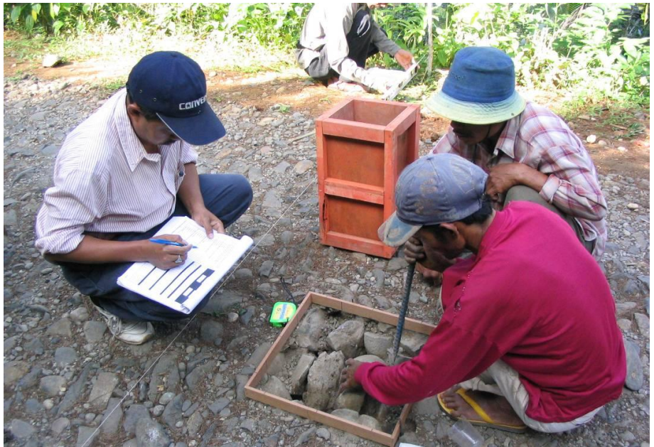
Measuring Leakages in Road Works in Indonesia; PI: Ben Olken (MIT)