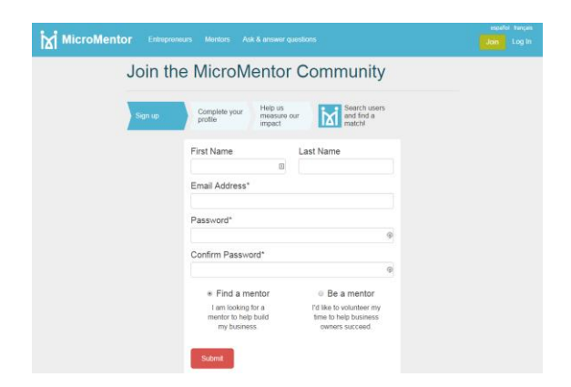
Panel B. Original version of registration page