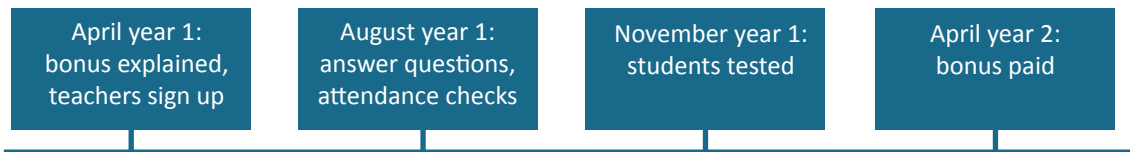
Figure 1: KiuFunza implementation cycle summary

At the end of the school year, all students in Grades 1, 2, and 3 in every school, including control schools, were tested in reading Kiswahili, reading English and Maths. As this test was used to determine teacher incentive payments, it is high-stakes (from the teacher’s perspective). The tests were developed by Tanzanian education professionals, following a similar test development framework as the Uwezo Annual Learning Assessment that is widely used in East Africa. The test results were digitized and processed. By early April of the following year teachers received the bonus payment in their bank or mobile money account, according to their choice. This cycle of activities took place once in 2015, and once in 2016.