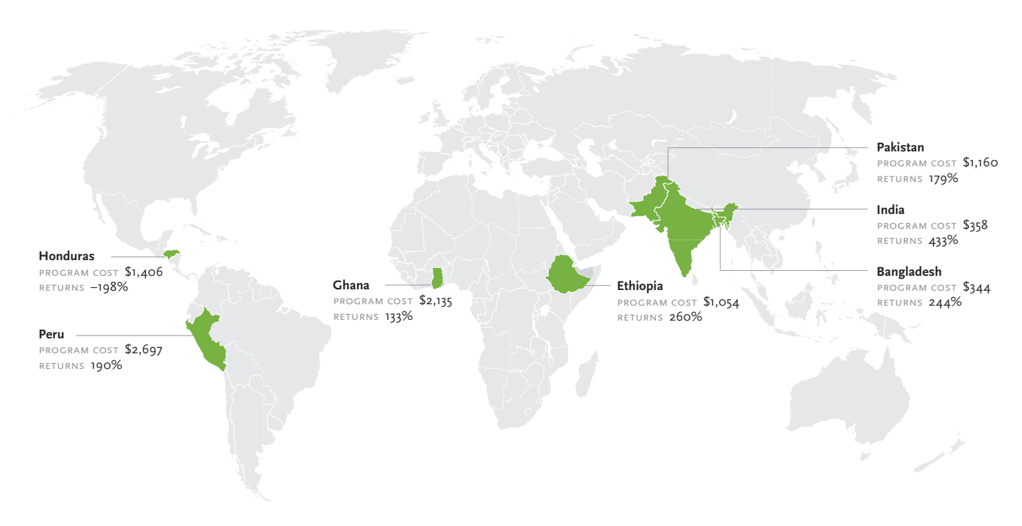
FIGURE 5 GRADUATION PROGRAM COST AND RETURNS PER PARTICIPANT BY COUNTRY 14