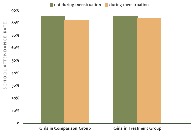
FIGURE 1: ATTENDANCE RATES, PERIOD & NON-PERIOD DAYS

Access to these products seemed to impact girls' lives in terms of convenience and mobility in managing their periods. For example, treatment girls reported spending 20 minutes less on laundry during their period days. Yet the product had no effect on other daily activities, self-reported gynecological infections, or self-esteem indicators.