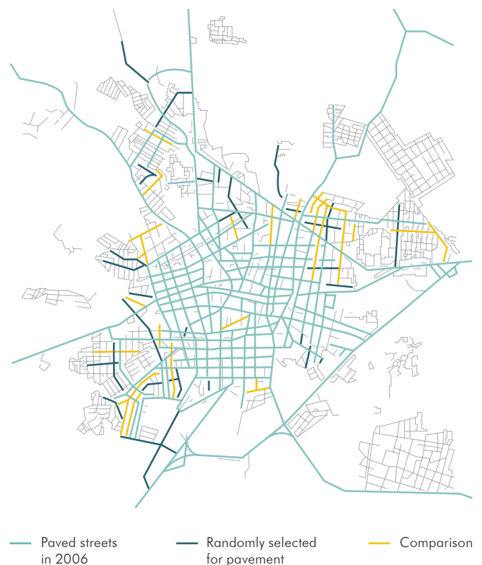
FIGURE 1. LOCATION OF STREET PAVEMENT PROJECTS IN ACAYUCAN, MEXICO

Researchers worked with the government of Acayucan to randomly select 28 of 56 potential street pavement projects. These streets were in low-income, residential areas on the outskirts of the city.